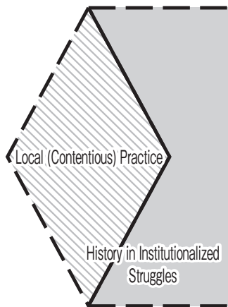
FIGURE 3 Relations between local contentious practice and historically institutionalized struggles (Adapted from Holland & Lave, 2001, p. 7)

On the one hand, history is brought to the present moment of local time/space in the body/minds of actors. We call this set of relations between intimate, embodied subjectivities and local practice, “history-in-person.” Here, think of Bakhtin’s basic idea of practice. The person — the actor — is addressed by people and forces and institutions external to himself or herself and responds using the words, genres, actions and practices of others. In time, the person is forming in practice and so are the cultural resources that the person adapts to author himself or herself in the moment.